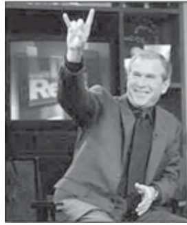
Bush flashing the “cornuto” - the Illuminati sign of Lucifer.

“If this were a dictatorship, it would be a heck of a lot easier... just so long as I’m the dictator.”